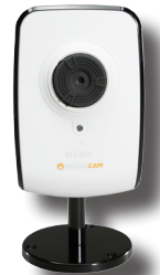
DLink® Web Enabled Camera

Static IP Address for set-up and configuration