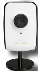
DLink® Web Enabled Camera

Static IP Address for set-up and configuration