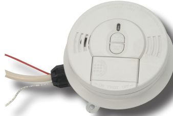
Smoke Alarm Kit