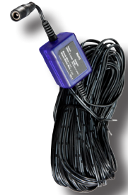
Power Fail Monitor