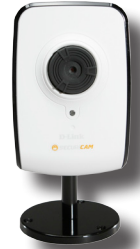
DLink® Web Enabled Camera

Static IP Address for set-up and configuration