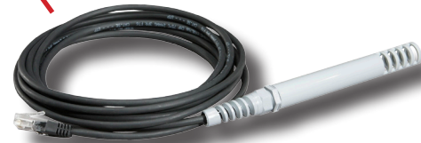
Temperature, Air Flow Humidity, & Dew Point

Optional Remote Sensors Connect via RJ12